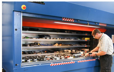
Commercial Grade Dedication